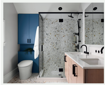
West Mt. Vernon